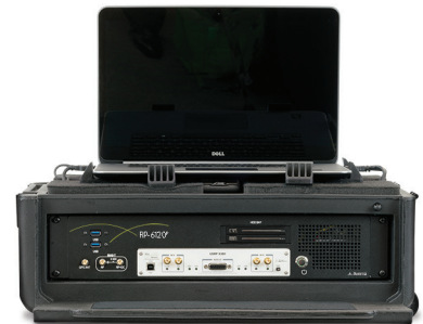
RP-6120P Capture real-world RF wherever you are.

Accelerate your RF product designs and research projects with the powerful and cost-effective RP-6100 – a state-of-the-art RF recorder solution.