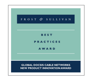
New Product Innovation Award from Frost & Sullivan

As a passive sniffer between CMTS and CPE devices, the DP-1000 silently captures and filters DOCSIS MAC-layer data in real-time to verify RF parameters, validate MAC-level communication, troubleshoot interoperability issues, and improve network performance.