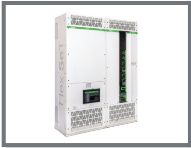
The new generation of low-voltage switchboards.